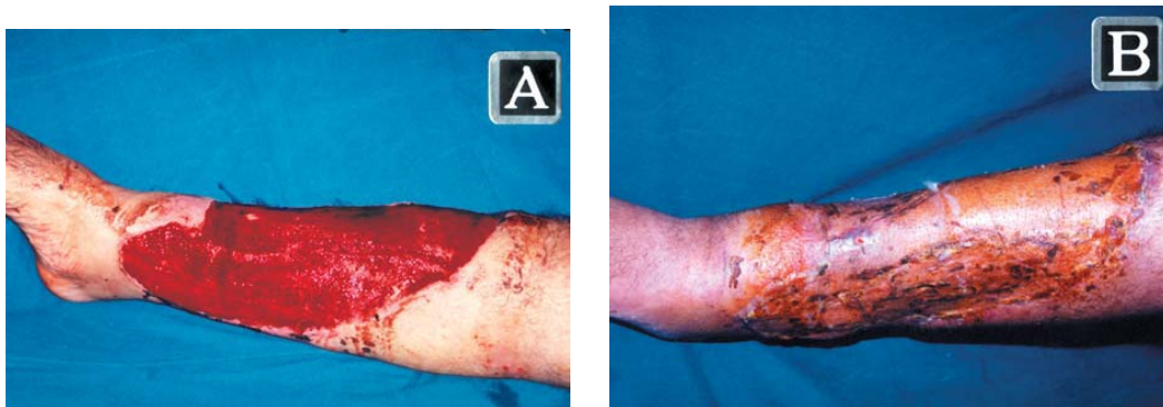
Fig. (2): Forty-eight years old male patient with venous leg ulcer of four years' ulcer duration. (A) Intraoperative appearance of the ulcer immediately after layered shaving technique. (B) Complete healing of the ulcer after single application of split-thickness skin graft, 1 year after surgery.